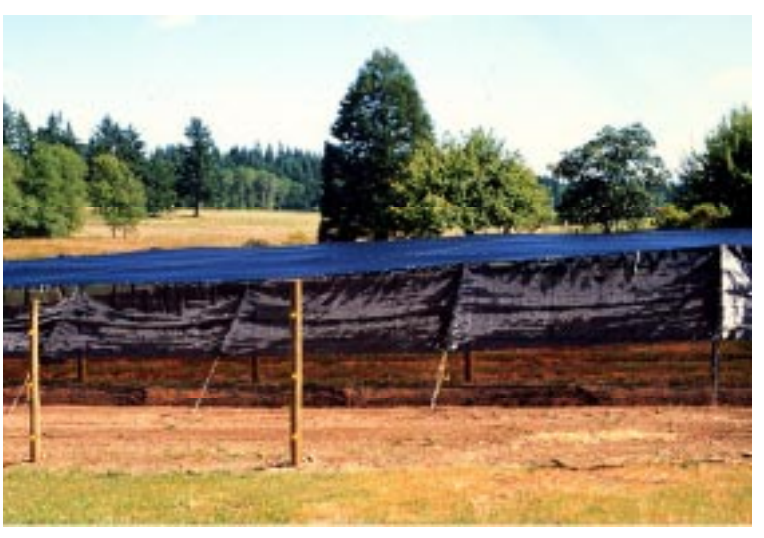
Modern plastic-weave shade structure

on a human hand). In year two a stalk emerges which supports two leaves, each with five leaflets. In years three and four, the emerging stalk gives rise to three and four leaves, respectively, once