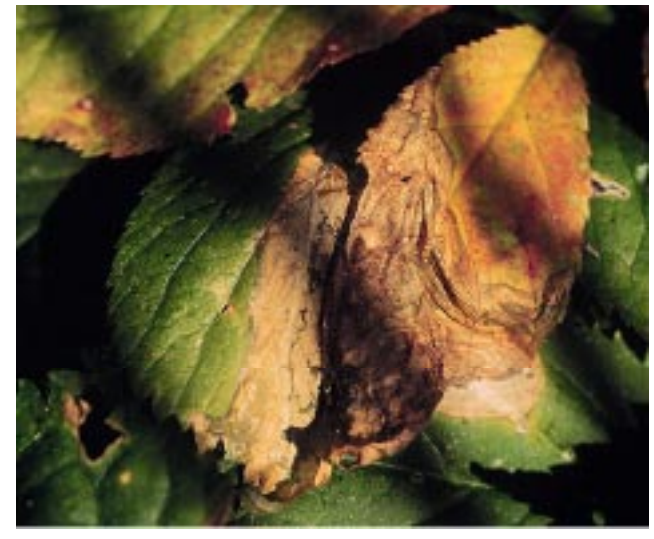
Botrytis cinerea lesion on cultivated ginseng leaves.

Of the foliar disorders affecting ginseng in areas west of the Cascades, Botrytis leaf blight is the most common. The cool, cloudy weather, with abundant spring rainfall, sets the ideal conditions for pathogen spread. Botrytis cinerea overwinters in the debris and surrounding vegetation near the ginseng garden (5). In the spring the fungus begins to grow and release spores which can be carried by