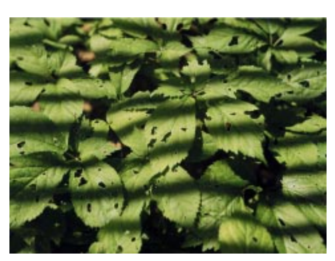
Slug damage on ginseng plant leaves.

APPLICATION: Broadcast 20 to 40 pounds over