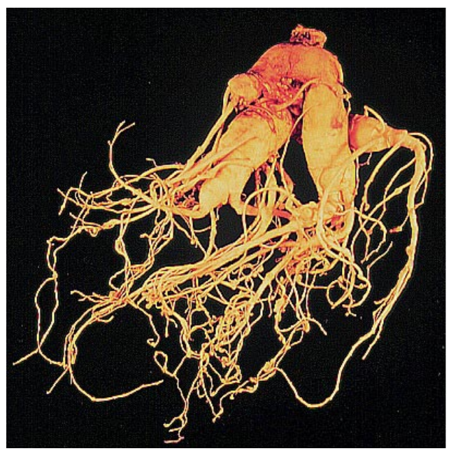
Root-knot nematode damage. Note swellings on root bairs.

The crop grown before ginseng plays a role in nematode population dynamics. Alfalfa can