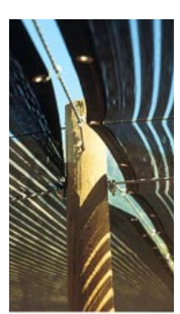
Posts, wire, and 80% sbade panels used to shield plants from the sun's rays.

help speed air movements over the plants which