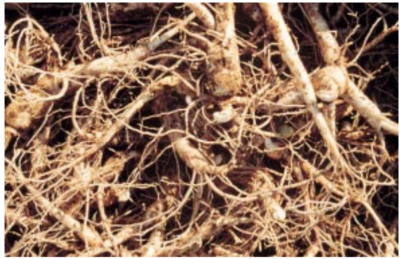
Freshly dug root waiting to be washed

Growers select sites possessing well-drained sandy loam soil. Some growers have installed agricultural drain tile in their fields where winter flooding has been observed. Poorly drained ground has been found to be the leading cause of root rot in established gardens. In the Northwest, ginseng plantings are predominately established on pasture ground. All existing vegetation is cleared using