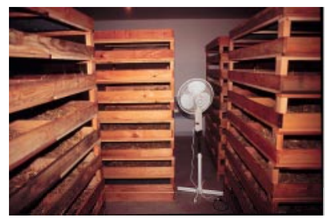
Ginseng drying shed, showing shallow trays and fan to distribute warm air.

In September and October new fields are prepared for planting. If they have been planted into summer cover crops the fields are plowed, disked and beds shaped for September seeding. In gardens ready for digging (year four) all posts, wire, and shade cloth must be removed. For any garden over an acre in size a potato harvester pulled behind a tractor is used to lift the roots to the soil surface where they can be picked up by hand. After freshly harvested roots wilt for 3-4 days (to help improve their color), they are washed carefully with clean water. If roots are destined for the fresh trade they are placed into cold storage